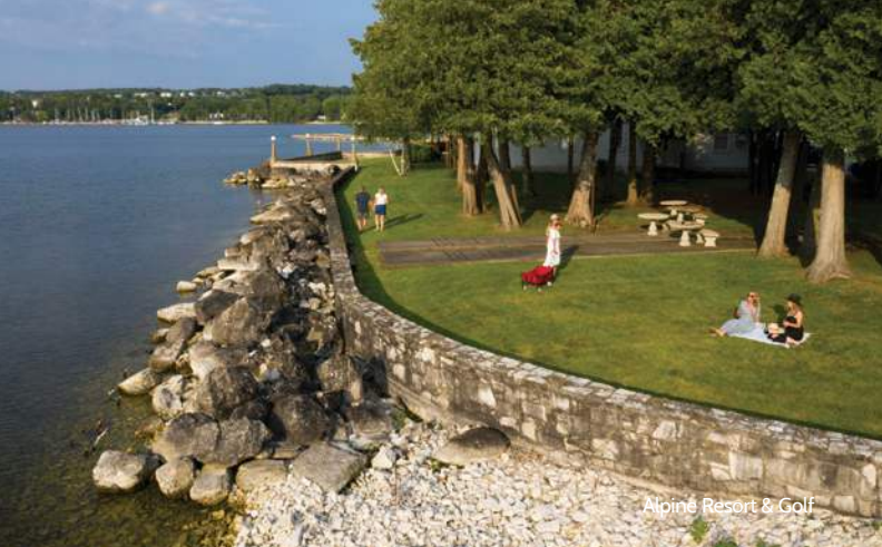
Alpine Resort & Golf